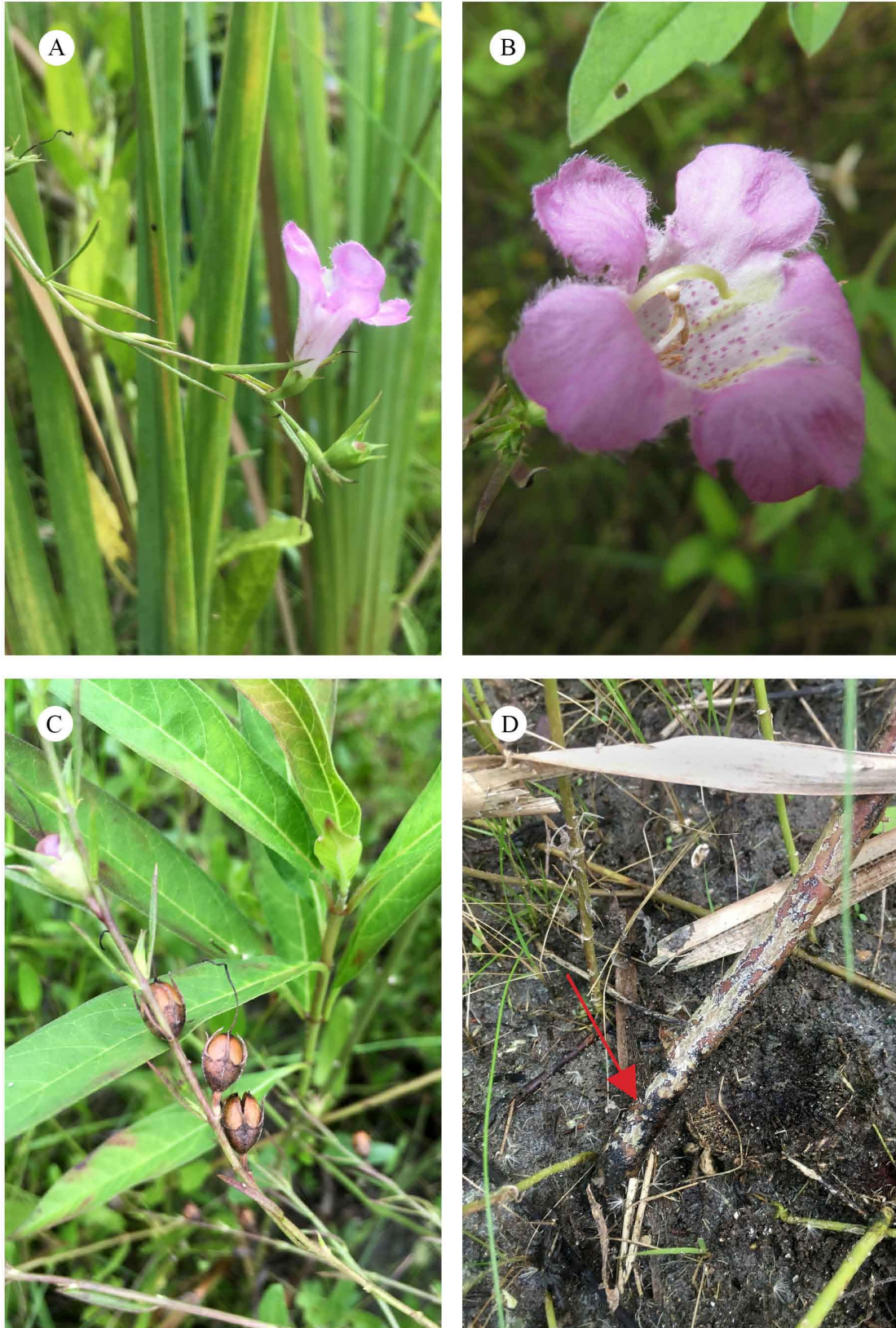
FIGURE 2. Agalinis manglaris . A: flower in lateral view, B: flower in frontal view, C: infructescence, D: base of the main stem (indicated with red arrow).